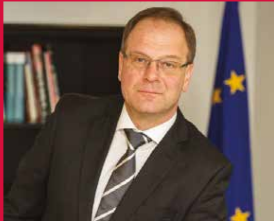
Tibor Navracsics Commissioner for Education, Culture, Youth and Sport

This generation of young Europeans has been hit hard by the economic crisis. The transition from education into the labour market has become more difficult. About one out of five young jobseekers under 25 cannot find work. And many young people believe that their concerns are not taken up by politicians. More than half of them feel that in their country young people have been marginalised and excluded from economic and social life.